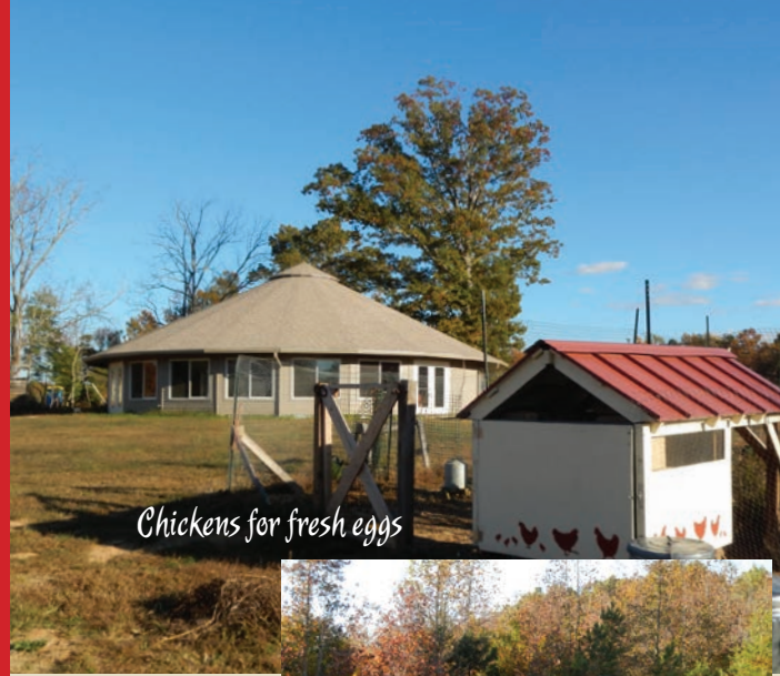
Chickens for fresh eggs